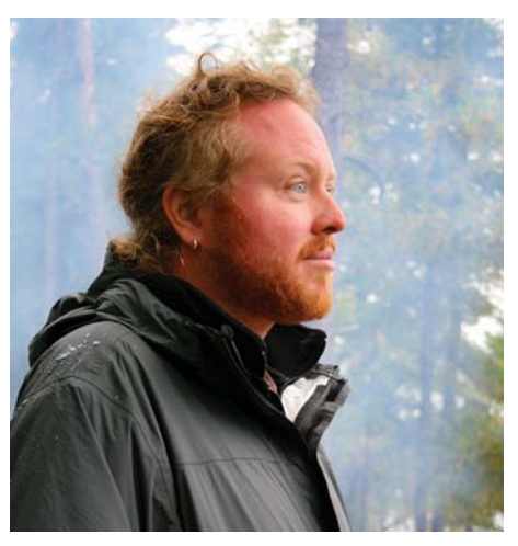
outdoor marimbas and xylophones for the Nature Explore Classroom catalog, which sells the instruments throughout the United States and abroad.